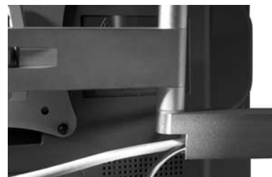
Built-in internal cord management channels