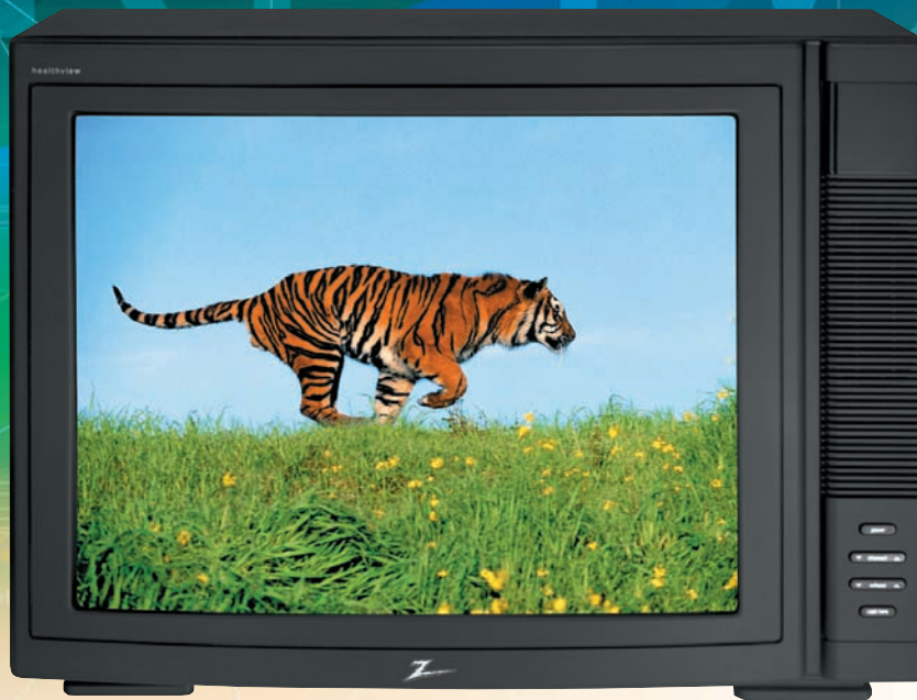
20" Remote Control Color TV H20J55DT